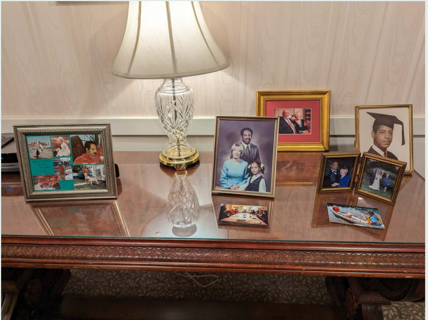
Turner Family Photos.