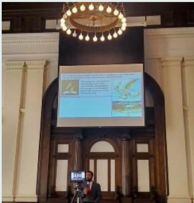
Darryl Campbell-SpaULDing teaches the three angels message during Sabbath School.

In-person Sabbath School attendance is strongly encouraged in order to experience the exciting program changes.