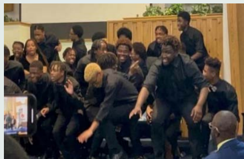
The Pine Forge Academy Choir performing the song Jacob's Ladder.

taught me the value of respect and showed me mannerisms. They taught me how to grow in personality by becoming more open with my interests and vocal about my opinions.