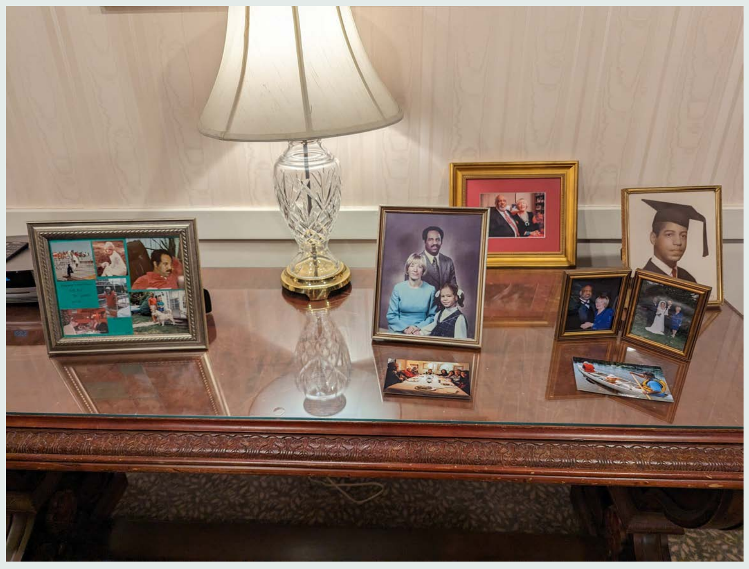
Turner Family Photos.