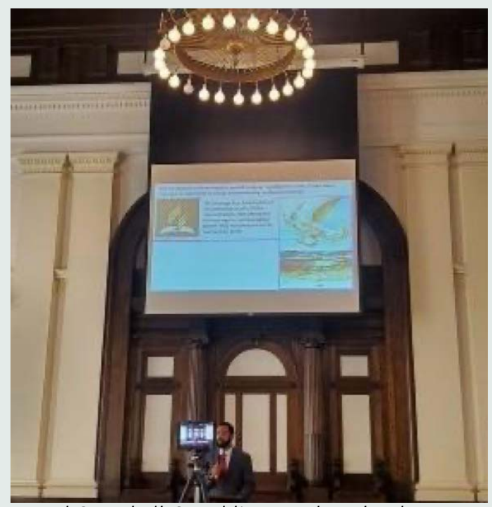
Darryl Campbell-Spaulding teaches the three angels message during Sabbath School.

In-person Sabbath School attendance is strongly encouraged in order to experience the exciting program changes.